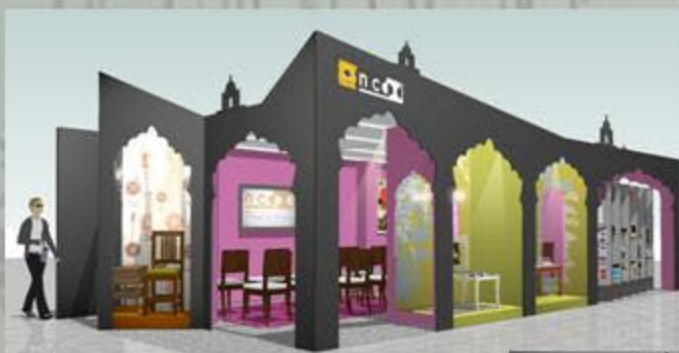
EXTERIOR PERSPECTIVE 01 N.C.D.P.D. PROPOSED BOOTH SETTING DESIGN

• NCDPD offers the services for stand design and visual merchandising. Please note that the services are available on a first come, first served basis.